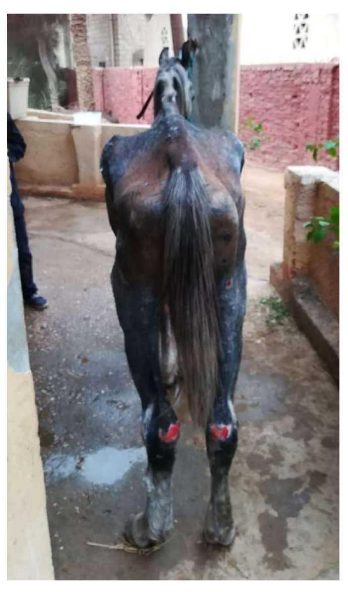
Appallingly skinny and covered in wounds, this patient was found abandoned to his fate in the street.

The pace of life for locals here seems fast and aggressive, and the working horses and donkeys seem to be taking the brunt of a frustrated and unempathetic generation, as I found in Luxor and my initial trip to Cairo. Cairo roads were famous in Luxor for being totally chaotic, and I can see why now. Sadly, but unsurprisingly, it's very common for horses to get run over in Egypt, and I've seen some gruesome wounds caused by traffic accidents. With patience and strict wound management — of which there's plenty at EEA! — I have been astounded to witness miraculous recoveries of horses brought in with unimaginable injuries. Unfortunately, it's not uncommon for horses to be left dying in the street after being run over — it's truly so sickening to think of them already exhausted and abused, to then get run over and be abandoned in agony on the filthy, loud streets.